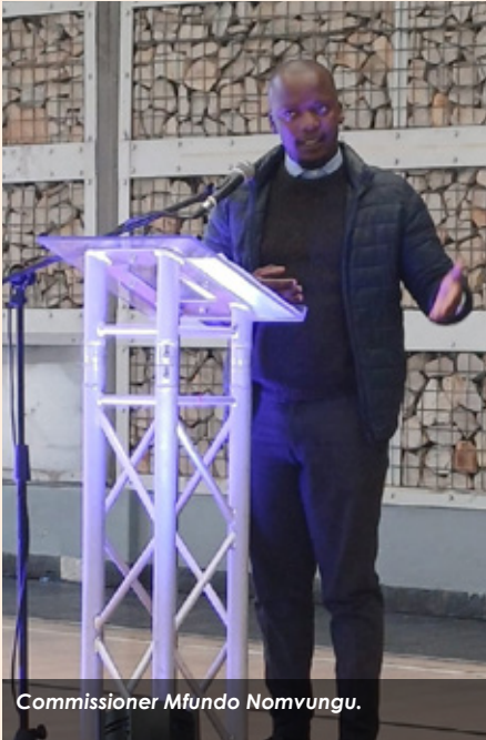
Commissioner Mfundo Nomvungu.

Commissioner Mfundo Nomvungu represented the Commission for Gender Equality (CGE) at a high-level stakeholder engagement hosted by the Department of Justice and Constitutional Development in the lead-up to its Budget Vote in Cape Town on 09 July 2025. "During the critical engagement session, the significance of gender as a cross-cutting issue within the justice system became clear," said Commissioner Nomvungu. Discussions in the session highlighted operational conditions of Thuthuzela Care Centres as raised by the CGE, the functionality of sexual offences courts as monitored by CGE, delays in the delivery of rape kits, and the eviction of women farm workers in the Western Cape as observed by the CGE. The session also addressed the implementation of legislative measures