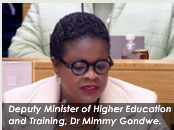
Deputy Minister of Higher Education and Training, Dr Mimmy Gondwe.

Parliament's Portfolio Committee on Higher Education has raised concerns about the level of gender-based violence and sexual harassment in universities and TVET colleges. The Committee held a briefing session with