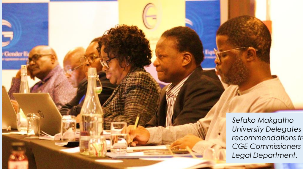
Sefako Makgatho University Delegates noting recommendations from CGE Commissioners and Legal Department.