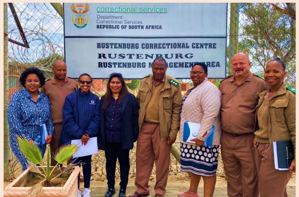
CGE Commissioner Prabashni Subrayan-Naidoo conducted an oversight monitoring visit to the Rustenburg Correctional Centre in the North West province.