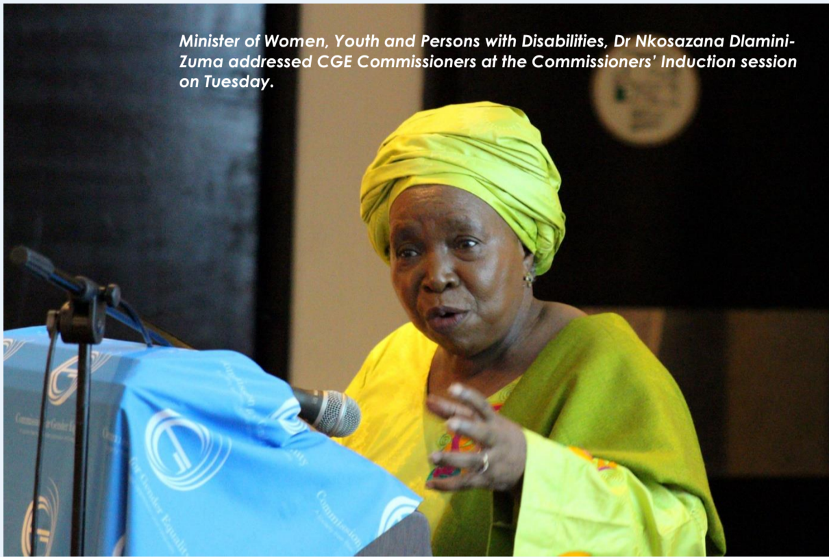
Minister of Women, Youth and Persons with Disabilities, Dr Nkosazana Dlamini-Zuma addressed CGE Commissioners at the Commissioners' Induction session on Tuesday.

The Commission for Gender Equality (CGE) has a critical mandate in the development of South Africa and should receive more support from government and civil society. These were the words of Minister of Women, Youth and Persons with Disabilities, Dr Nkosazana Dlamini-Zuma, who addressed CGE Commissioners at their induction on Tuesday in Rosebank. The Minister further stated that it will be difficult for gender equality to be realised in the country if the work that needs to be done is not allocated enough financial resources. "I am concerned that entities that are meant to ensure gender equality and protect the rights of women are always allocated the least budgets. This tells you a lot about how issues of